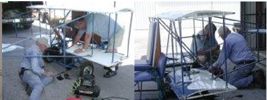
Would you trust these guys?