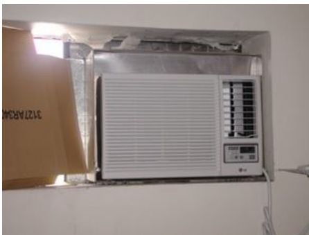
Finally, some comfort!!

Folks gathered at the Chapter Hangar on the 2nd to perform some annual condition inspection chores on the Mascot. While they were there, the new air conditioner / heat pump unit was installed. Finally, we won't be burning up in the summer and freezing in the winter.