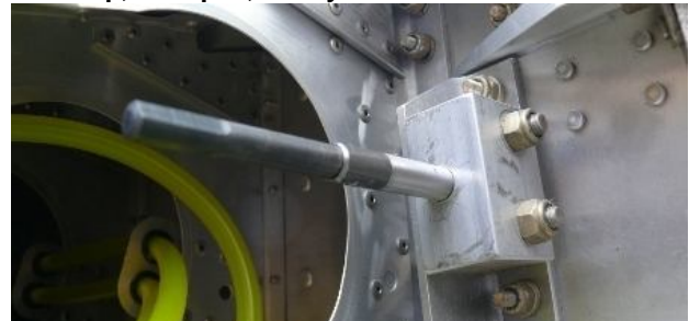
Had to Insert Drill into Sleeve before Chucking (Sleeve prevented drill from wallowing existing good holes.)