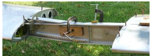
Lined up, Clamped, Ready to Drill

Unfortunately, at this point in the project, about all I have left is dependent on the wings being rigged. Lots of final buttoning-up to do, including first engine start. More to come soon, as I'll be presenting my project status at the October General Meeting.